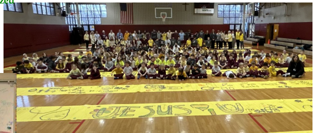
St. Norbert raised $2,000 during their Nickels for Neighbors drive.