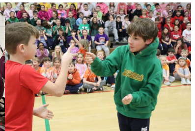
St. Patrick School had a Rock Paper Scissors tournament and the money raised was sent to a Catholic high school in CA damaged by the recent fires.