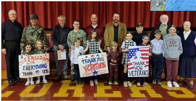
Saints Simon and Jude School "Celebrated Our Nation" and gave a special blessing to veterans.