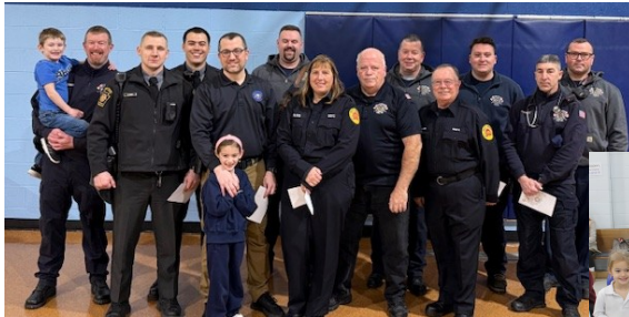
Assumption BVM School hosted a prayer walk for the first responders of their community.