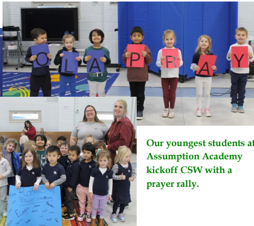
Our youngest students at Assumption Academy kickoff CSW with a prayer rally.