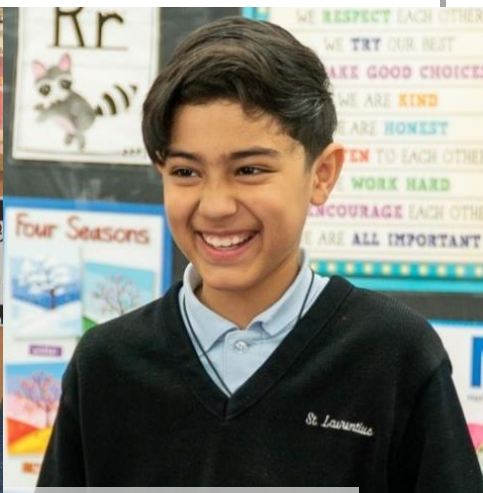
St. Laurentius School