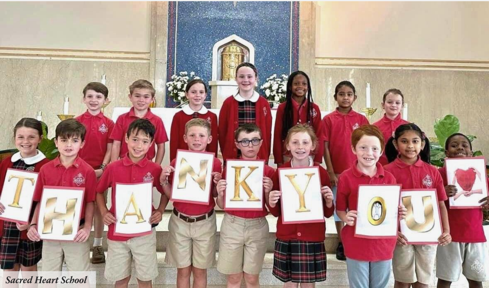
Sacred Heart School