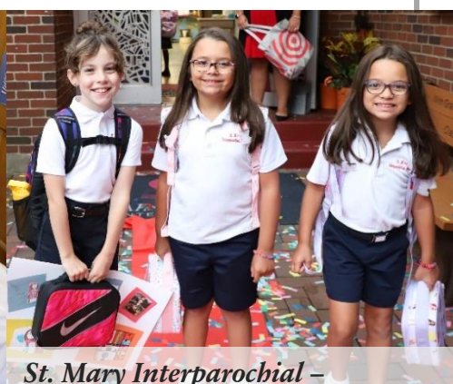
St. Mary Interparochial – National Blue Ribbon School 2023