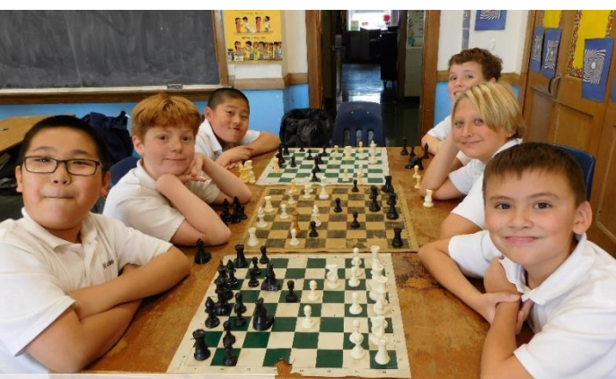
St. Matthew School