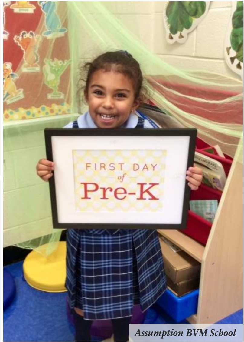
Assumption BVM School