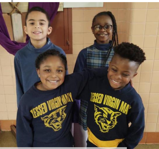
Blessed Virgin Mary School

If your school is interested in joining SPAT, contact the Foundation today!