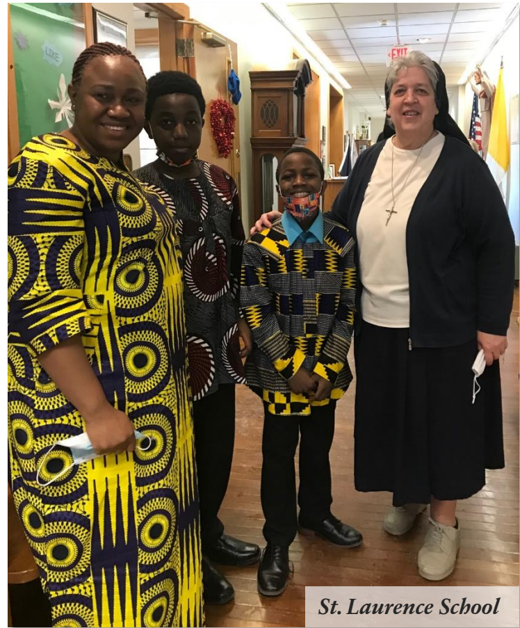
St. Laurence School