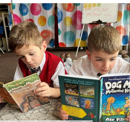
Sacred Heart School

To promote the growth and vitality of Catholic Elementary Education in the Archdiocese of Philadelphia