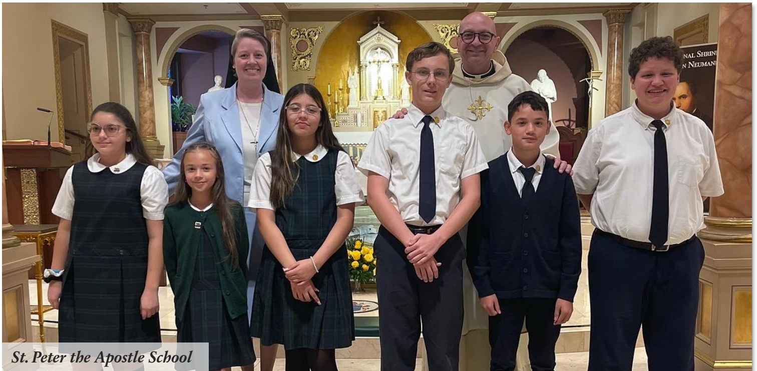
St. Peter the Apostle School

Average decrease in budgeted parish subsidy for SPAT schools in 23-24