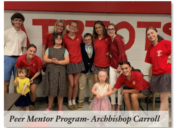
Peer Mentor Program- Archbishop Carroll

RISING TOGETHER ALLIANCE INCLUSIVE CATHOLIC EDUCATION