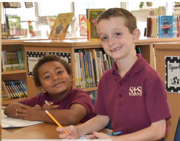
Ss. Simon & Jude School