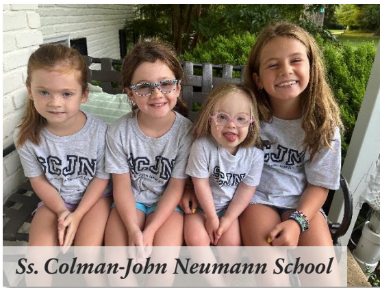
Ss. Colman-John Neumann School

In the 2023-2024 school year, ten students with intellectual disabilities will receive an inclusive education under this program. Through the Rising Together Alliance, professional development has reached over 70 principals and 110 teachers. We work to ensure that every door within our Catholic community is open to all God’s children. For more information, visit www.risingtogetheralliance.org .